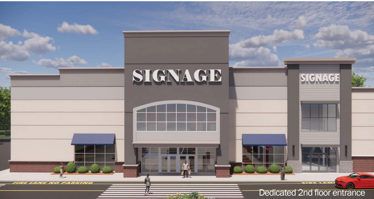
Dedicated 2nd floor entrance

1385 Washington St. (Route 1) No. Attleboro, MA 02760