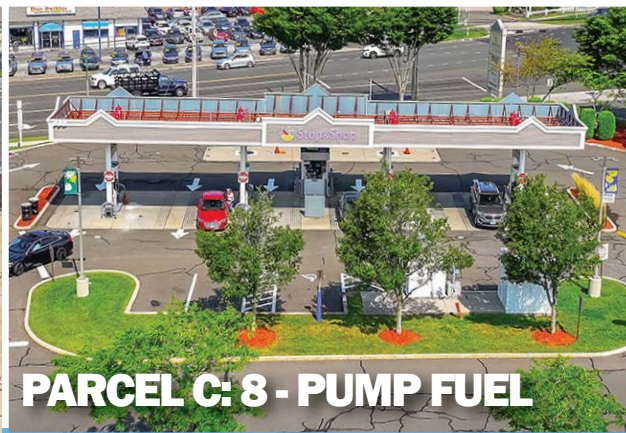
PARCEL C: 8 - PUMP FUEL