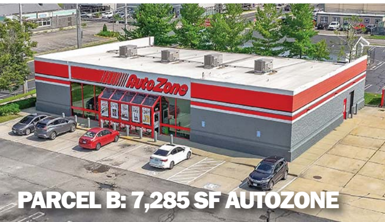
PARCEL B: 7,285 SF AUTOZONE