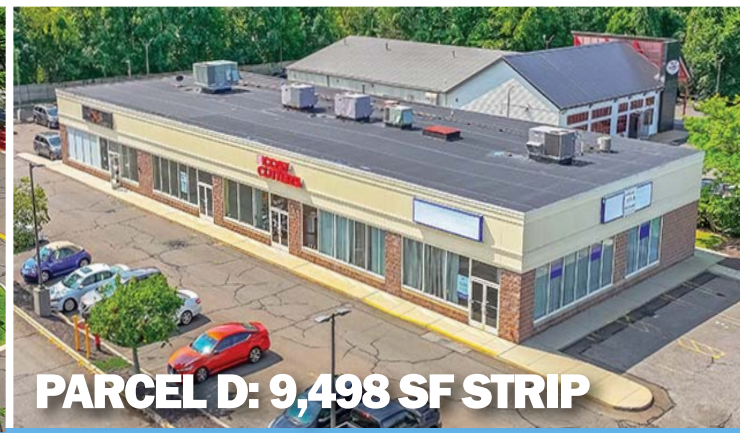
PARCEL D: 9,498 SF STRIP