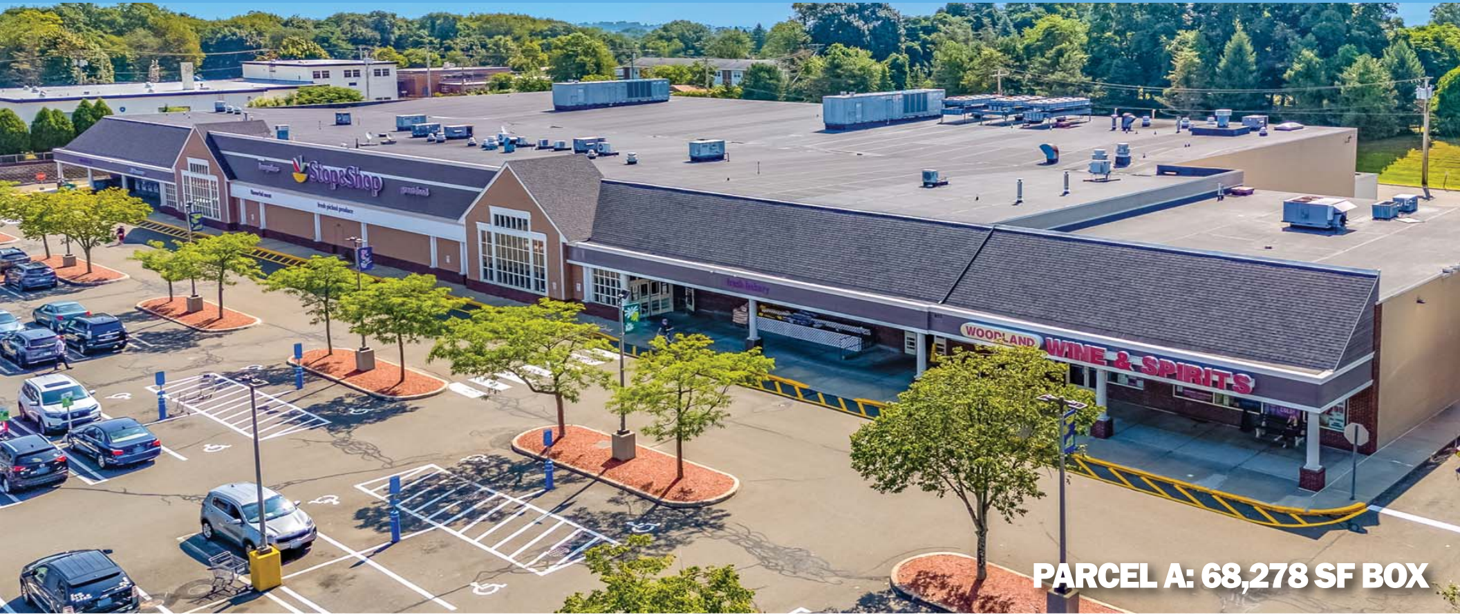
PARCEL A: 68,278 SF BOX