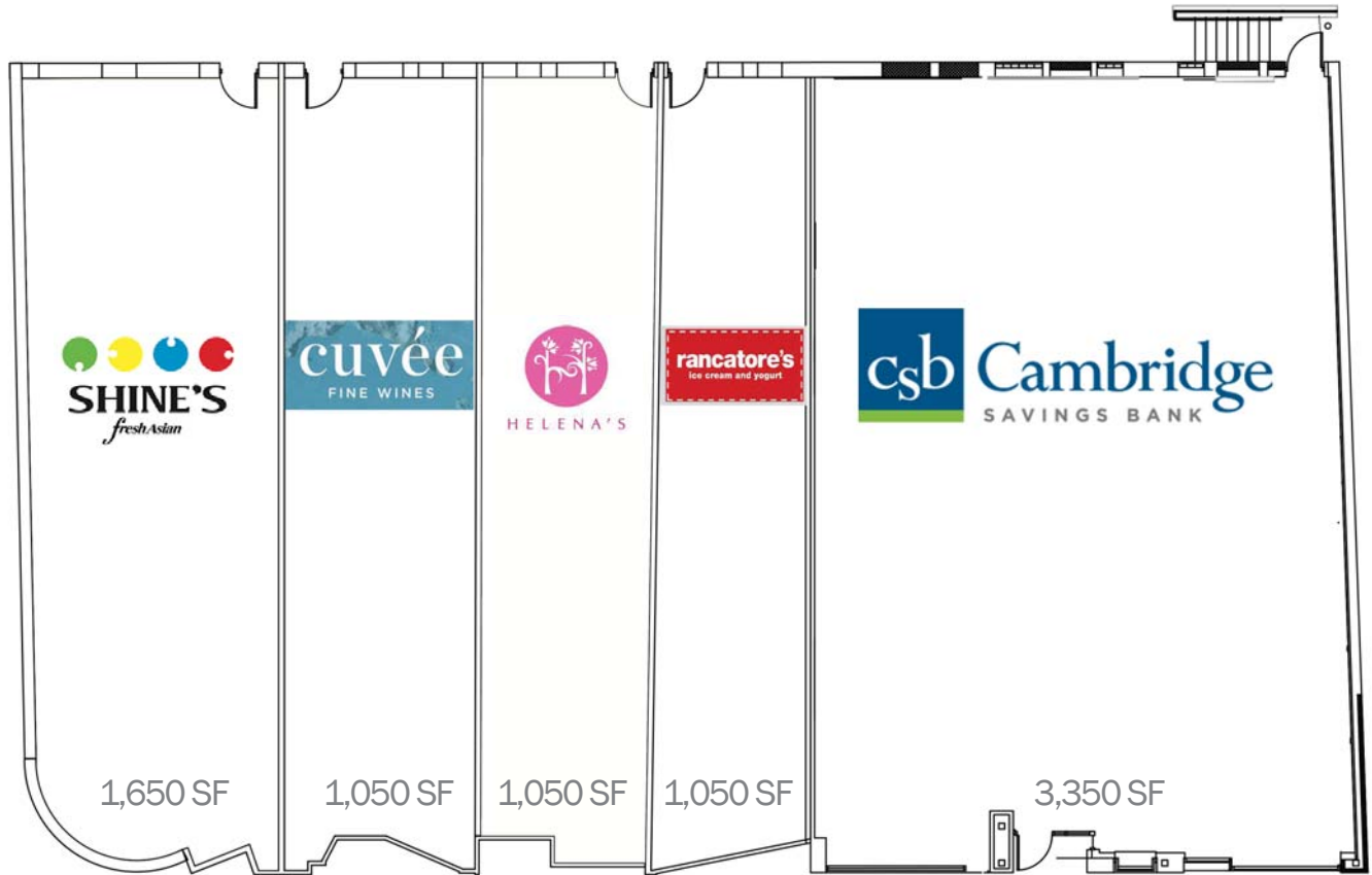
Leonard Street 12,716 ADT