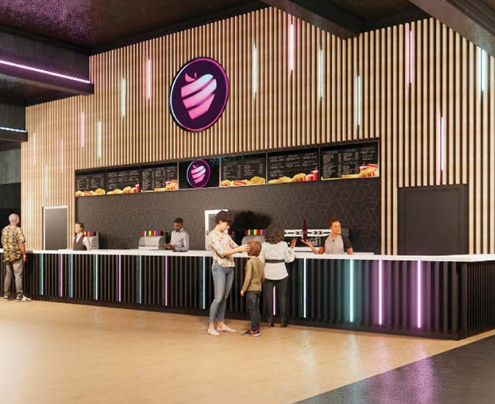
Rendering of Danville, CA location, opening soon